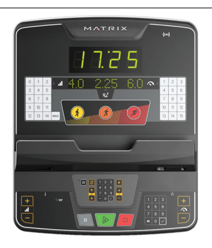
Group Training LED - large easy to read LED screen with features to assist with group exercise classes