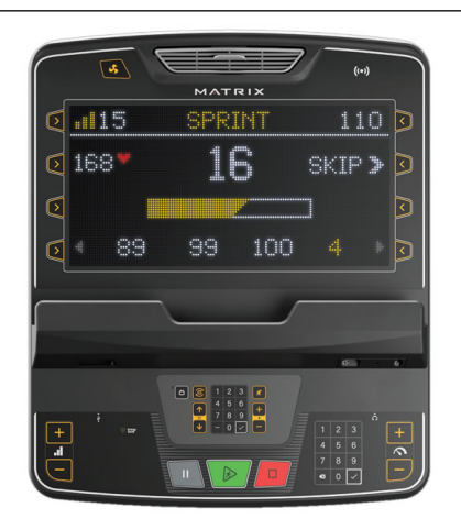
Premium LED - featuring an 8,000 pixel multi-colour LED screen with WiFi connectivity